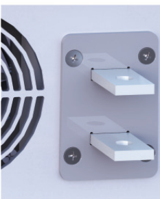
DC tin plated copper bus bars installed in back panel