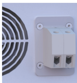
DC high voltage clamps installed in back panel