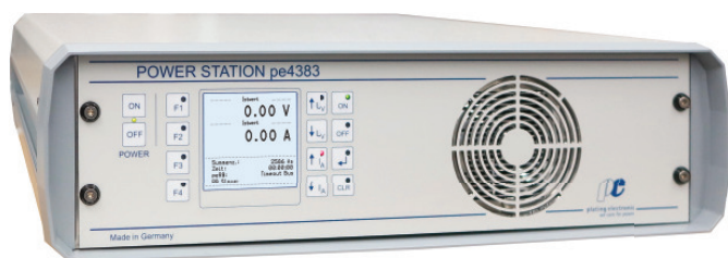
POWER STATION pe4383-ESK, front view

DC power supply in switch mode technology, designed for use in electroplating.