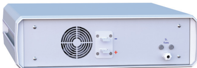
POWER STATION pe4383-ESK, back view